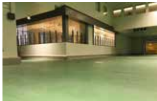
Tuna Auction Observation Deck

This is where domestic and foreign fisheries are gathered and traded. Here, the tuna auction is viewable from the visitor's deck.