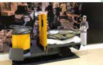
Turret Forklift on Exhibit