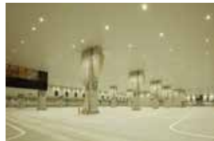
Fruit and Vegetables Wholesale Market (Viewable from the deck)